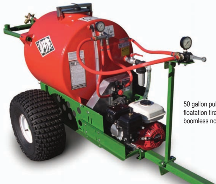
50 gallon pul-tank with floatation tires and boomless nozzle