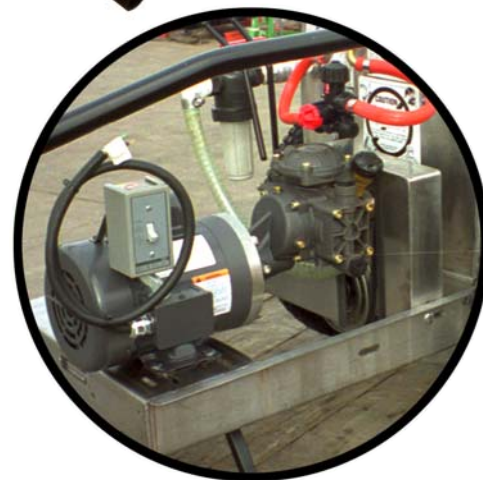
Electric 1hp motor & AR 19 pump

Rears has designed a Pak-Tank utility sprayer with wheelbarrow maneuverability. With many of the features of the Pak-Tank , the Nifty Nursery Cart is an ag-industrial grade sprayer that easily wheels through tight spots.