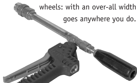
Braglia trigger, standard

The stainless steel frame rides on indomitable mountain bike wheels: with an over-all width of 26", this sprayer goes anywhere you do.